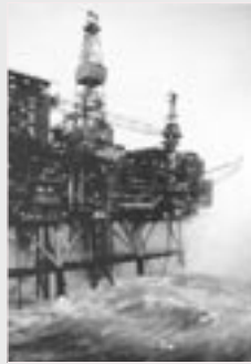
Offshore and Onshore Exploration and Production